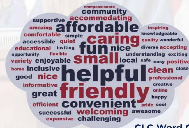
CLC Word Cloud