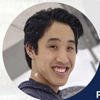
Tyler Welding & Fabrication Program Student

There are vocal and instrumental opportunities for all music lovers. Instrumental groups include the Wind Symphony, Jazz Orchestra, String Orchestra, Brass Ensemble, Woodwind Ensemble and Percussion Ensemble. The Concert Choir and Chamber Singers are great vocal music options. CLC's audio recording studio is available through classes and club activities.