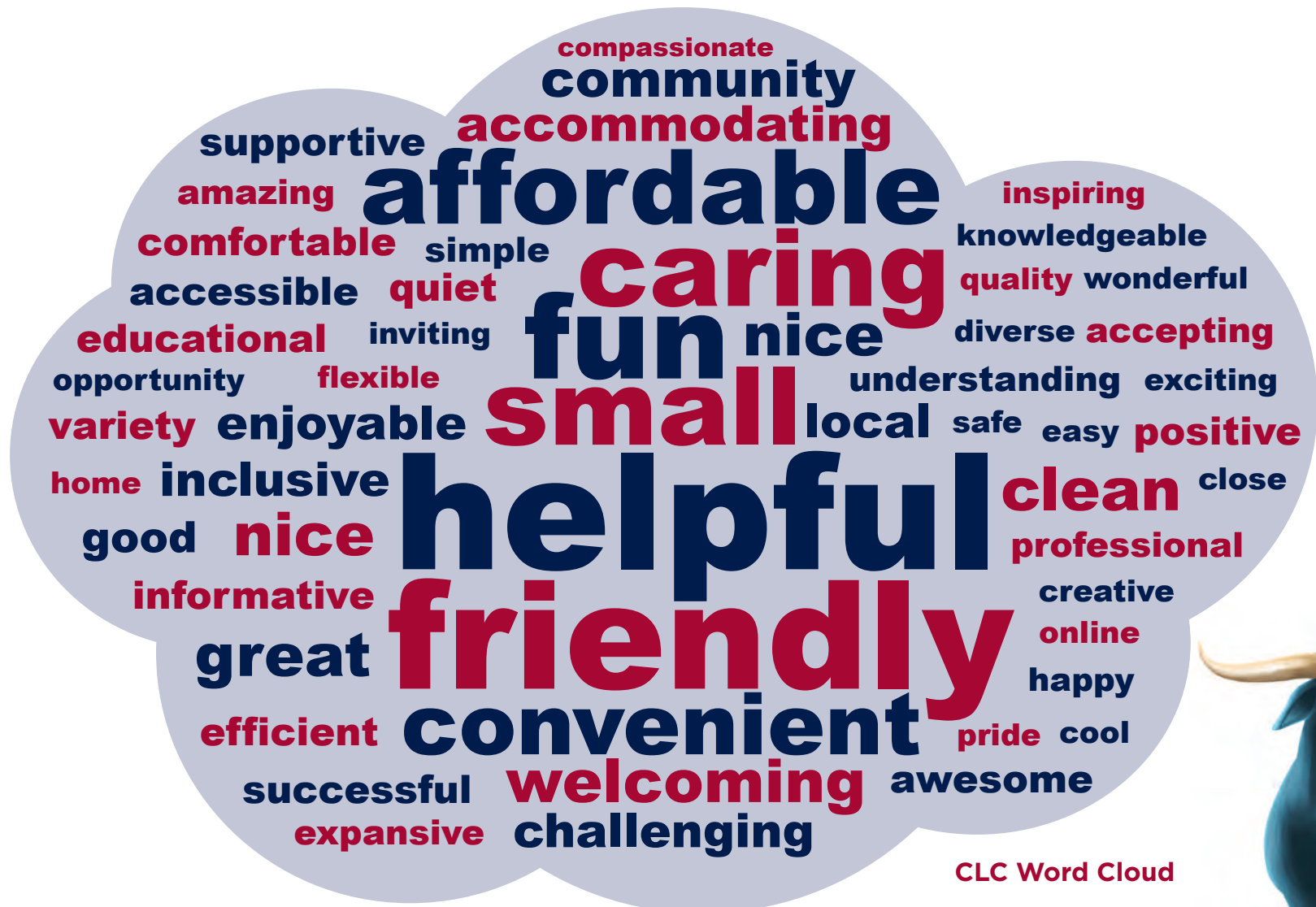
CLC Word Cloud