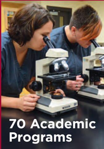
70 Academic Programs