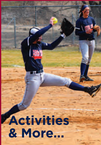
Activities & More...